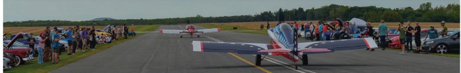
To kickoff the event, an airplane show went through the runway to takeoff on the airstrip.

"The amount of people who showed up was insane. People were waiting for the biplane to take off, and we even had people who were waiting for the biplane to take off. It was a great day for everyone involved."