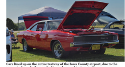
Cars lined up on the entire runway of the Iowa County airport, due to the amount of people the cars had to exit around halfway to 40 everynow.