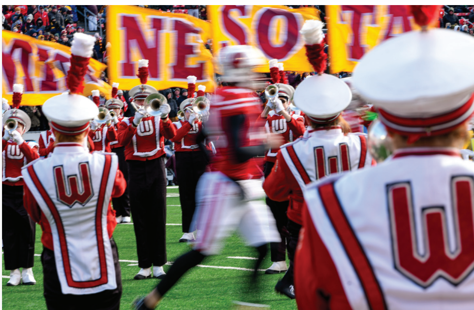
Sports Photography, 1st Place (Division A) The Daily Cardinal , UW-Madison