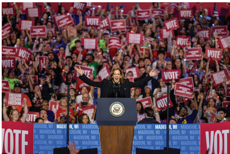
News Photography, 1st Place (Division A) The Badger Herald, UW-Madison

framing would have pushed this up higher. Great work still.