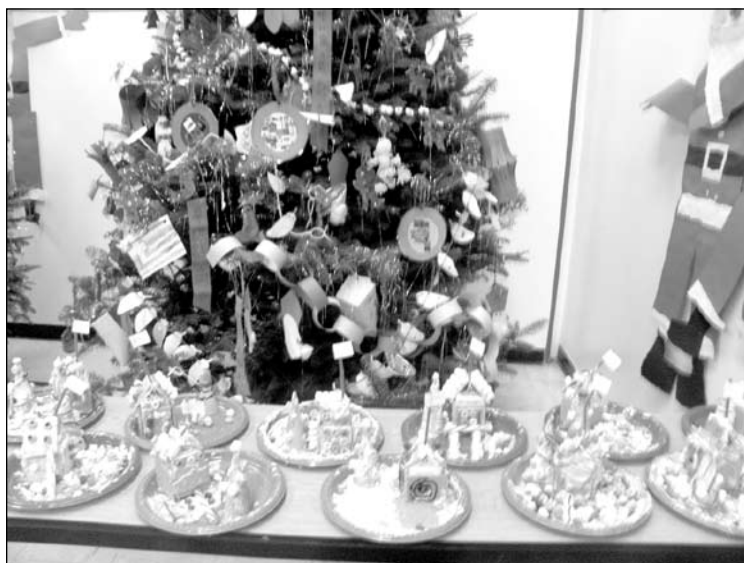
THE REPRESENTATIVE PHOTO

First graders learned about Holland traditions and put on a skit. Holland's major holiday tradition is celebrated on December 5 and is called Sinterklaas.