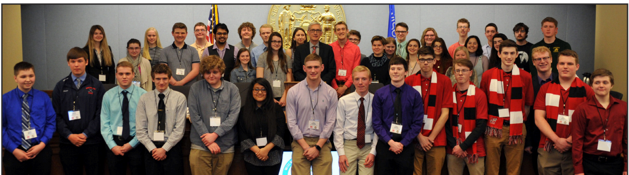
Gov. Tony Evers takes a photo with the 2019 Wisconsin Civics Games finalists on March 29, 2019, at the Wisconsin State Capitol in Madison, Wis.

After months of preparation and two days of competition, the team from Platteville High School was named the first-ever Wisconsin Civics Games champion. Each member of the team was awarded a $2,000 scholarship to a Wisconsin college or university.