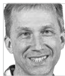
Watchdog Q&A Duke Behnke USA TODAY NETWORK - WIS.