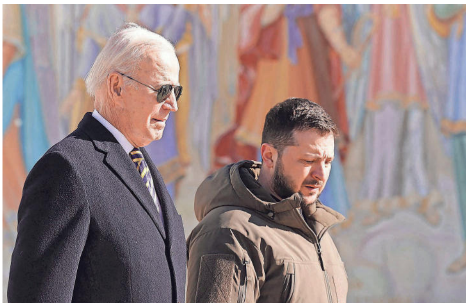
US President Joe Biden (L) walks next to Ukrainian President Volodymyr Zelensky (R) as he arrives for a visit in Kyiv on February 20. US President Joe Biden made a surprise trip to Kyiv on February 20, ahead of the first anniversary of Russia's invasion of Ukraine, AFP journalists saw. Biden met Ukrainian President Volodymyr Zelensky in the Ukrainian capital on his first visit to the country since the start of the conflict.