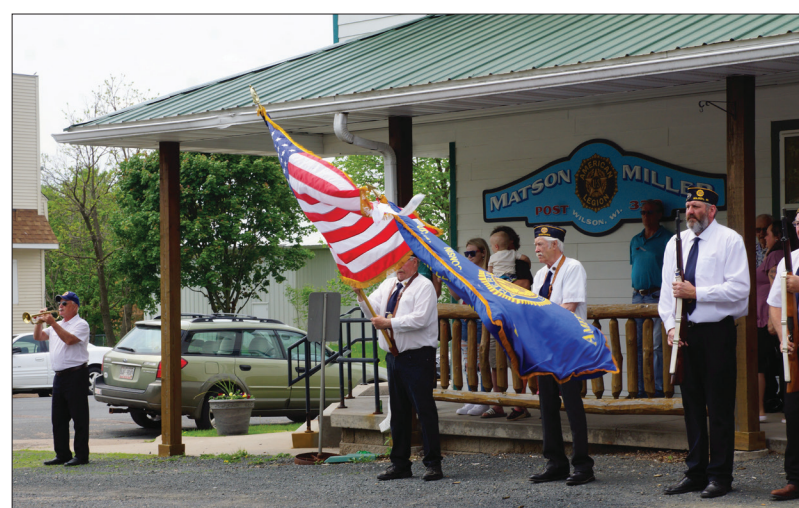
Memorial Day will be observed on Monday, May 29, 2023, attend an inspirational service if you can.