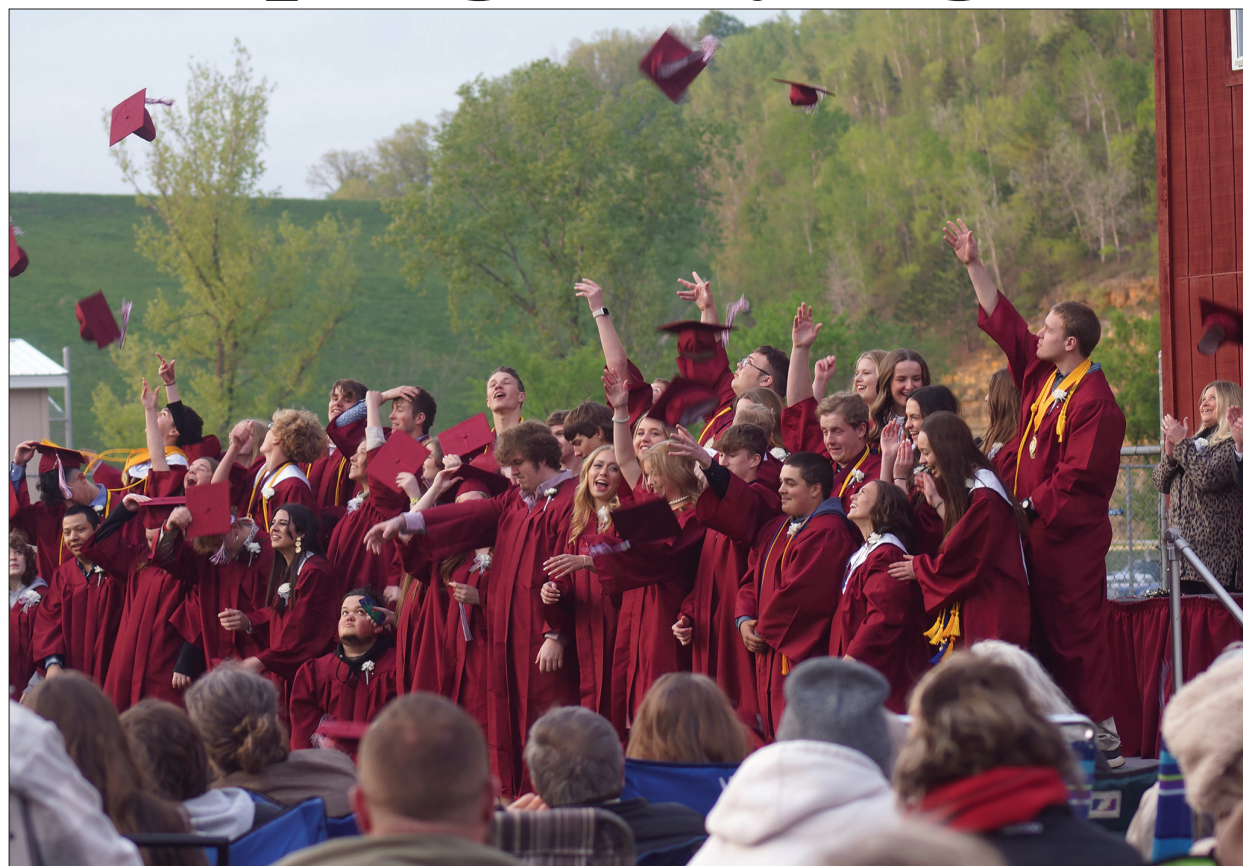
It's caps off in graduation celebration tradition for the Spring Valley High School Class of 2023.

In outdoor ceremonies 73 students receive diplomas