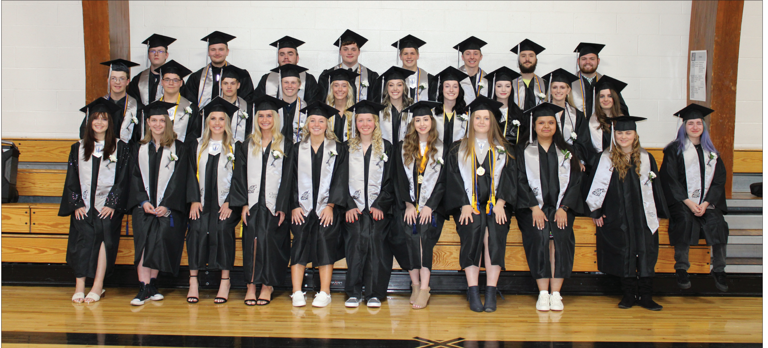
Here is the Elmwood Class of 2023.

In addition to Click It or Ticket, WisDOT's Buckle Up Phone Down campaign encourages drivers and passengers to be aware of the dangers of not wearing a seat belt throughout the year. Take the Buckle Up Phone Down pledge at wisconsin.gov/BUPD. Join as an individual, community group, or business and commit to traffic safety on every trip.