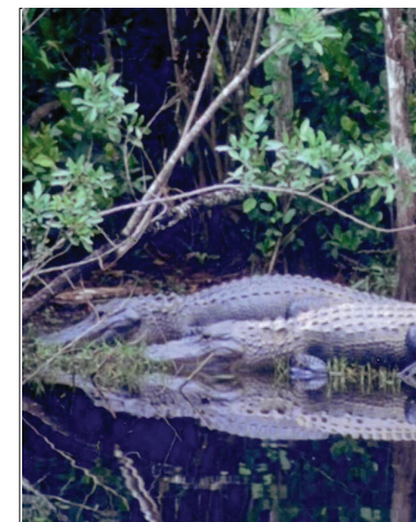
PAGE 4: A PAGE FROM A FAR PLACE - Gators in the Everglades.