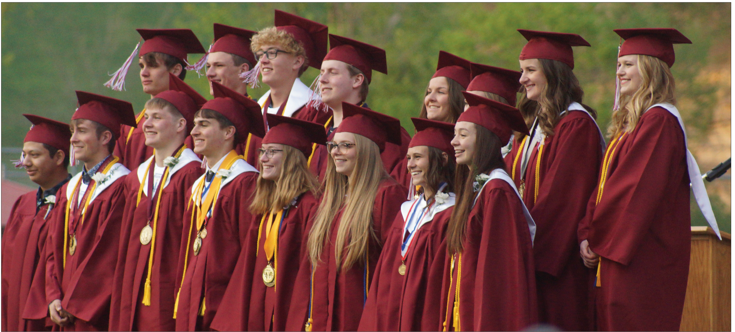
These are the SV Class of 2023 Honor Students that were recognized in the Graduation Ceremony on Friday, May 19, 2023.