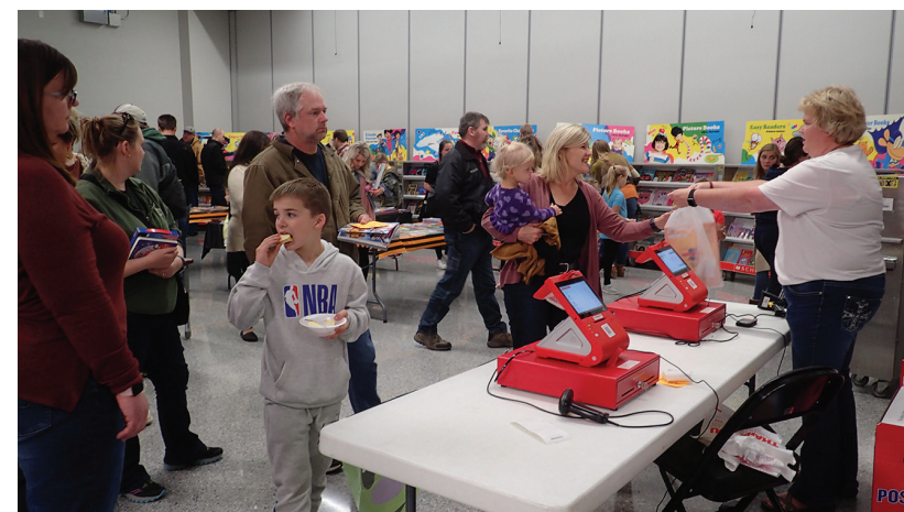
It was busy at the Book Fair.

Any business in Spring Valley is eligible and they do not have to be a current Chamber member to be nominated. Community members can vote several ways - by visiting a box located at establishments throughout town, by mailing a vote to PO Box 351, Spring Valley, WI 54767, emailing a vote to springvalleychamber@gmail.com, or by visiting the Spring Valley, WI Chamber of Commerce Facebook