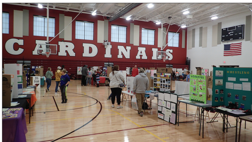
The EXPO projects were on display in the gym.

The school commons cafeteria was filled with students and their families taking part in the Book Fair, games, and a meal of walking tacos. The south utility gym is where the voting took place for the unique book-themed decorated pumpkins along with the reading area for the young authors. It was there that the