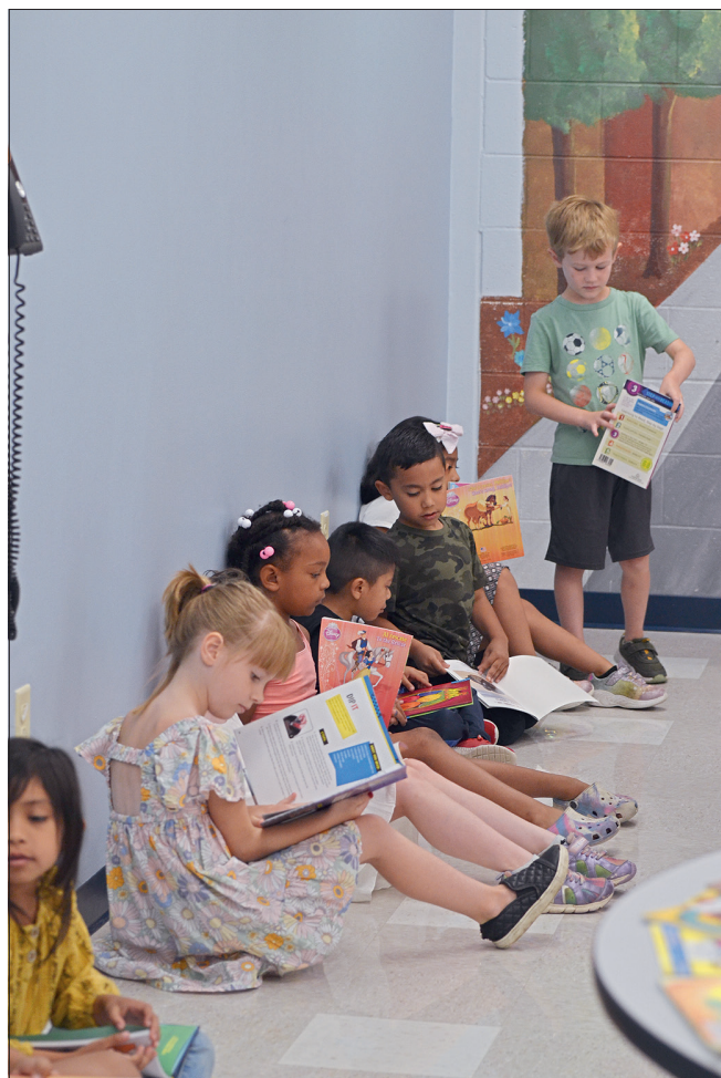
After choosing a book to take home, many students were eager to start reading right away.

not take their eyes off the pages while walking back to class.