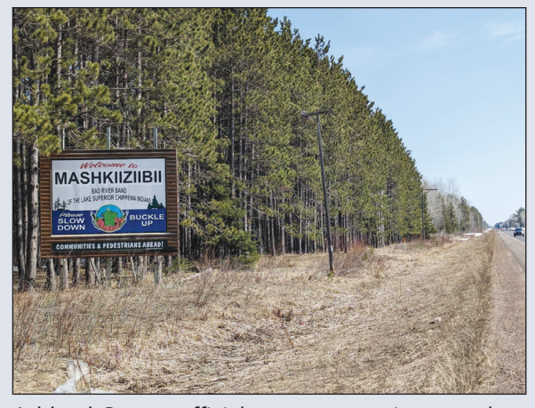
Ashland County officials are encouraging state legislators to find a solution to a property tax issue that caused 85% of Sanborn's land to be declared tax-exempt. (File photo)

the federal government pays local governments payments in lieu of taxes for Federal Forest land/parks, the counties are requesting the federal government do the same for properties no longer subject to tax, but still in need of tax-funded assistance. More particularly, Ashland County is joining other impacted counties in asking the state to reimburse them for settlement payments of $3.6 million made in accordance with state law between 2015-2022. The counties are also requesting the state makes aid payments over the next two years equal to the tax on the valuation lost as a result of the court's decision in the amount of $1.8 million, until a permanent solution can be developed.