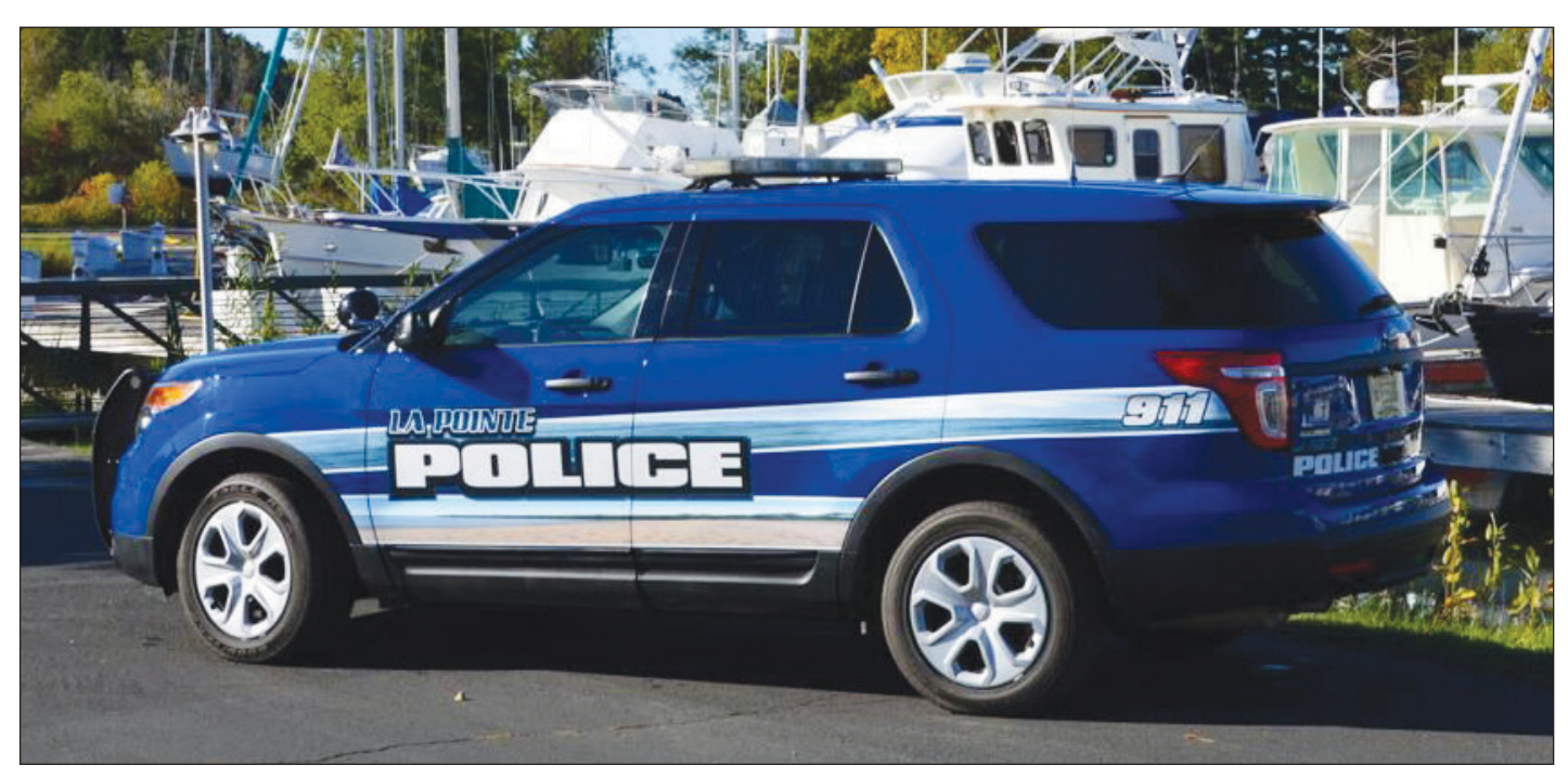
The Ashland County Board of Supervisors has denied the claims from La -Pointe regarding law enforcement.