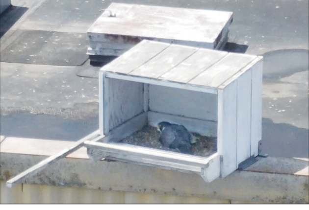
A peregrine falcon sits on at least four eggs at the Ashland power plant this week.

A tentative date for banding has been set for June 22. In early June, Daily Press readers will have the chance