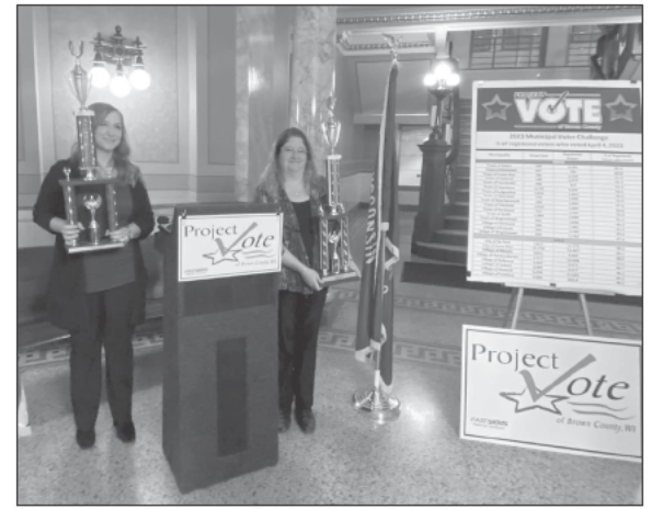
The town of Glenmore and the village of Allouez were awarded the Project VOTE of Brown County, WI Voter Challenge trophies on April 14.