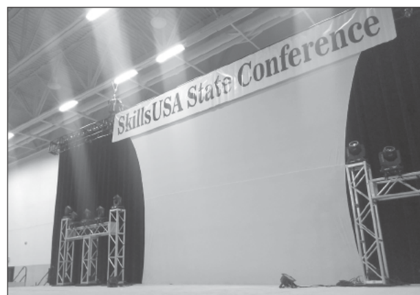
Area students will participate in the 50th annual SkillsUSA Wisconsin State Leadership and Skills Conference in Madison, April 25-26.