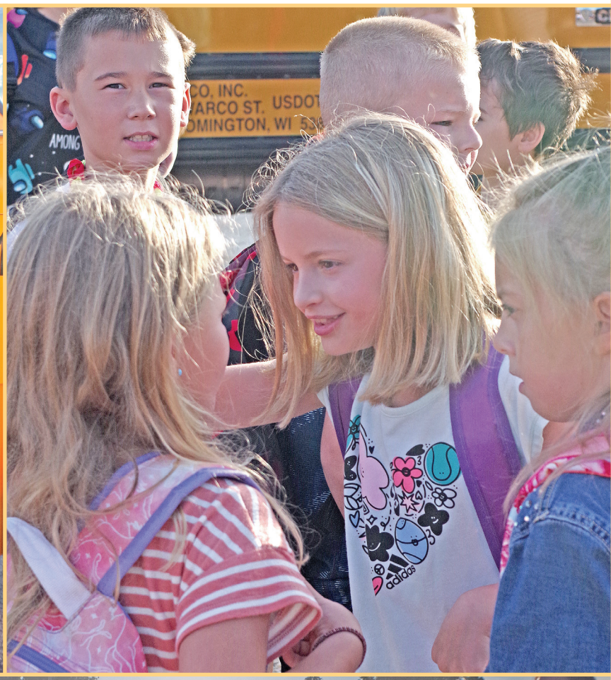
Sept. 1 is the official start for public schools in Wisconsin, and there was a lot of excitement and joy shown by the students when they arrived for their first day of classes at Potosi Elementary (above). Meanwhile, at the end of the day at Winskill Elementary in Lancaster, students couldn't wait to tell their parents about their first day (below)