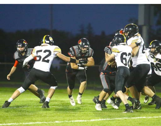
RJ Photo: Thomas Gunnell