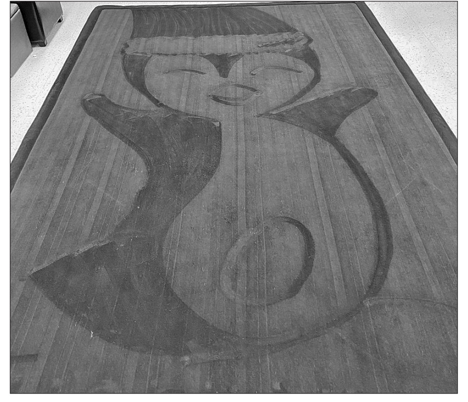
Vacuum drawing of a penguin.

calendar? editor@lakelandtimes.com an event Email