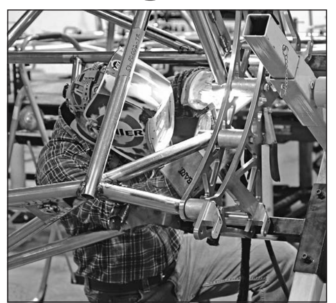
The Indy Special's custom spaceframe chassis is welded together at the manufacturing facility in Three Lakes.

The total building process for one car, without custom options, takes approximately four months. The Troy Indy Special is built from the ground up at the company's facility in with a TIG-welded space frame chassis, aluminum bodywork and innovative options on horsepower for the engine, 7fifteen creates a custom roadster uniquely capable of quick acceleration while boasting comfort. Exterior and interior options offer premium cosmetic customization to finish off the vehicle and provide buyers a high-performance car lavished in tailored luxury, a unique