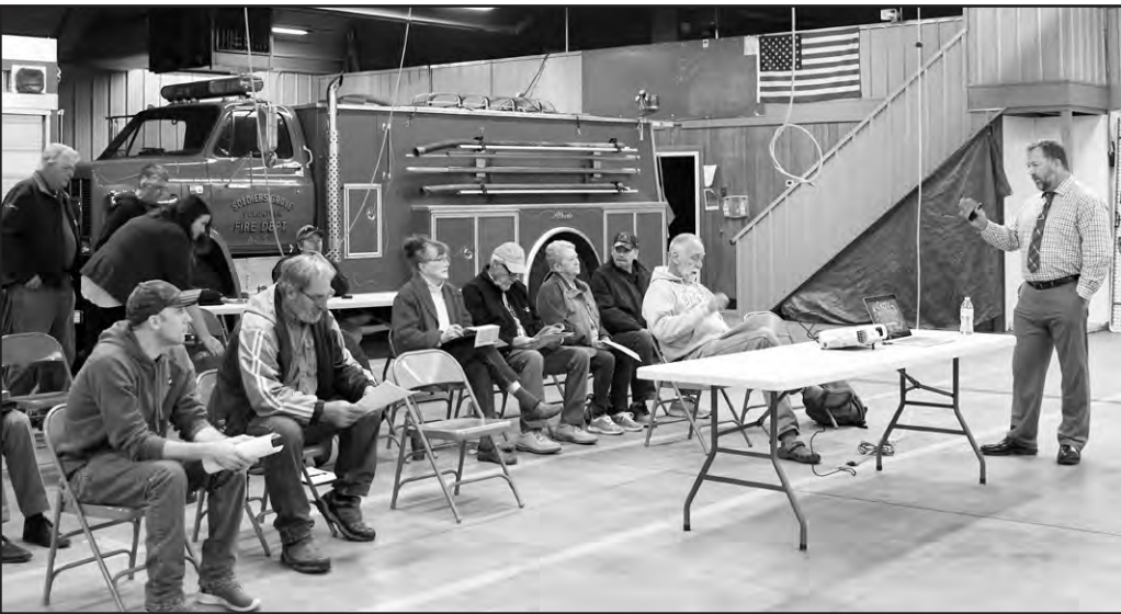
ALMOST 20 CITIZENS attended an information meeting about the upcoming operational and capital improvement referendums for the North Crawford School District. Voters in the district will be asked to vote 'yes' or 'no' on the ballot of the Tuesday, Nov. 8 General Election.