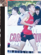
2 MILE 12 th 10:38.9

male or female runner," said Brookwood head coach Mindy Waddell. "That is a huge accomplishment in itself — to really have been one of the best runners in decades to come through the program."