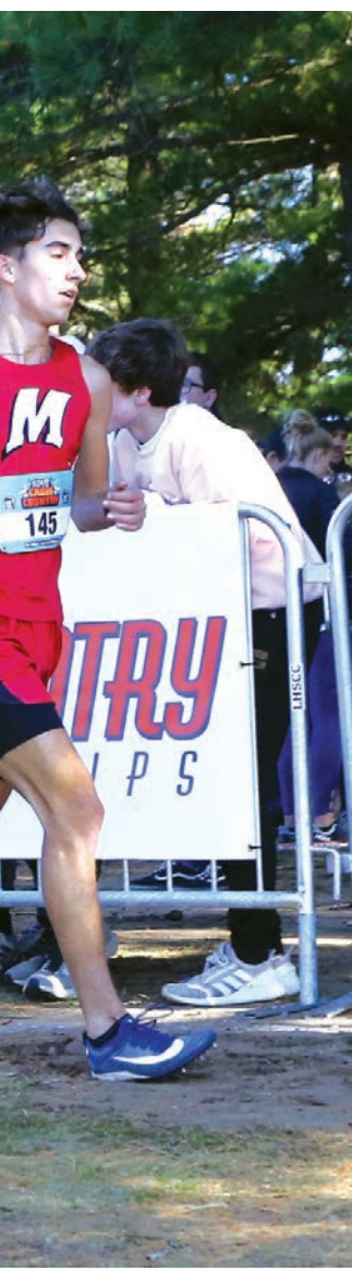
...ce at The Ridges Golf