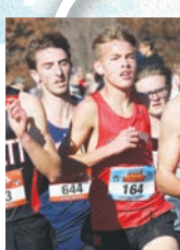
1 MILE 6 th 5:04.6