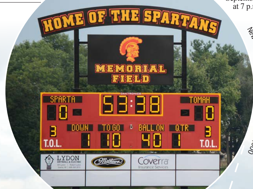
New scoreboard, approximate cost: $60,000