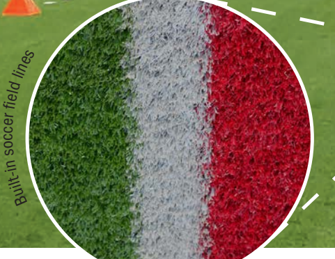
Built-in soccer field lines