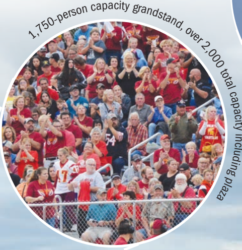
1,750-person capacity grandstand, over 2,000 total capacity including bleachers