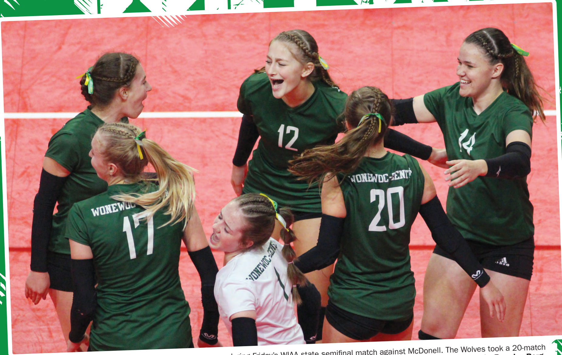
The Wonewoc-Center volleyball team celebrates a score during Friday's WIAA state semifinal match against McDonell. The Wolves took a 20-match win streak into the state tournament before losing to the eventual state champs 3-0 at the Resch Center in Green Bay.