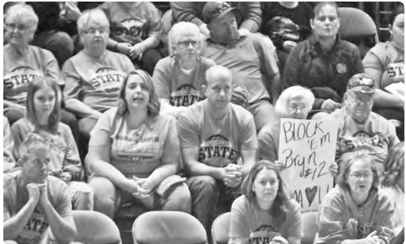
Wonewoc-Center fans travelled far and well to see their Wolves play at state for the second year in a row.