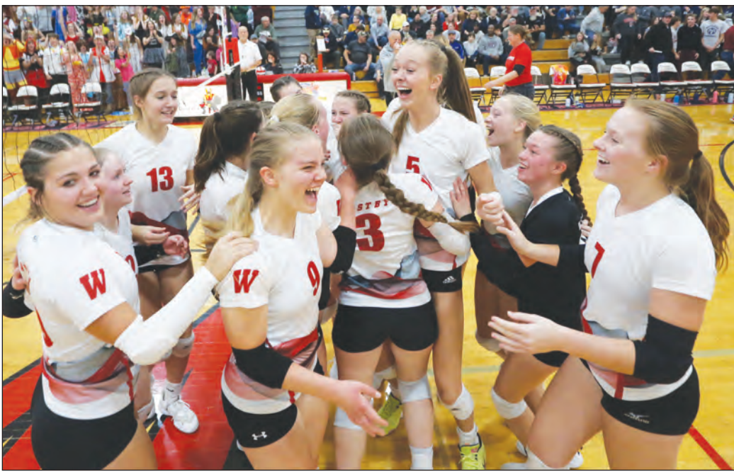
The Westby volleyball team had its historic season come to an end Saturday, October 29 after falling to St. Croix Falls 3-0 in a Division 3 sectional final. The Norsemen finish the year 33-2 overall for the program's best-ever mark.