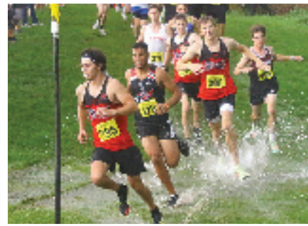
Panthers win boys title at Darlington Invitational

Pennekamp, Aide, Conolly lead IG boys Page 13A