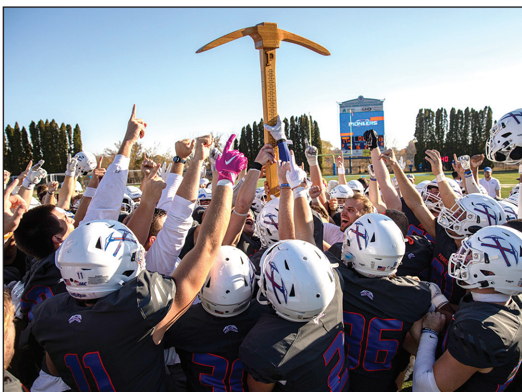
The UW-Platteville football team celebrates with the Miner's Axe rivalry trophy following Saturday's 17-13 upset over the #3-ranked UW-Whitewater Warhawks Saturday at Ralph E. Davis Pioneer Stadium.

WIAA DIVISION 2 VOLLEYBALL • NO. 6 PLATTEVILLE 3, NO. 2 RIVER VALLEY 1