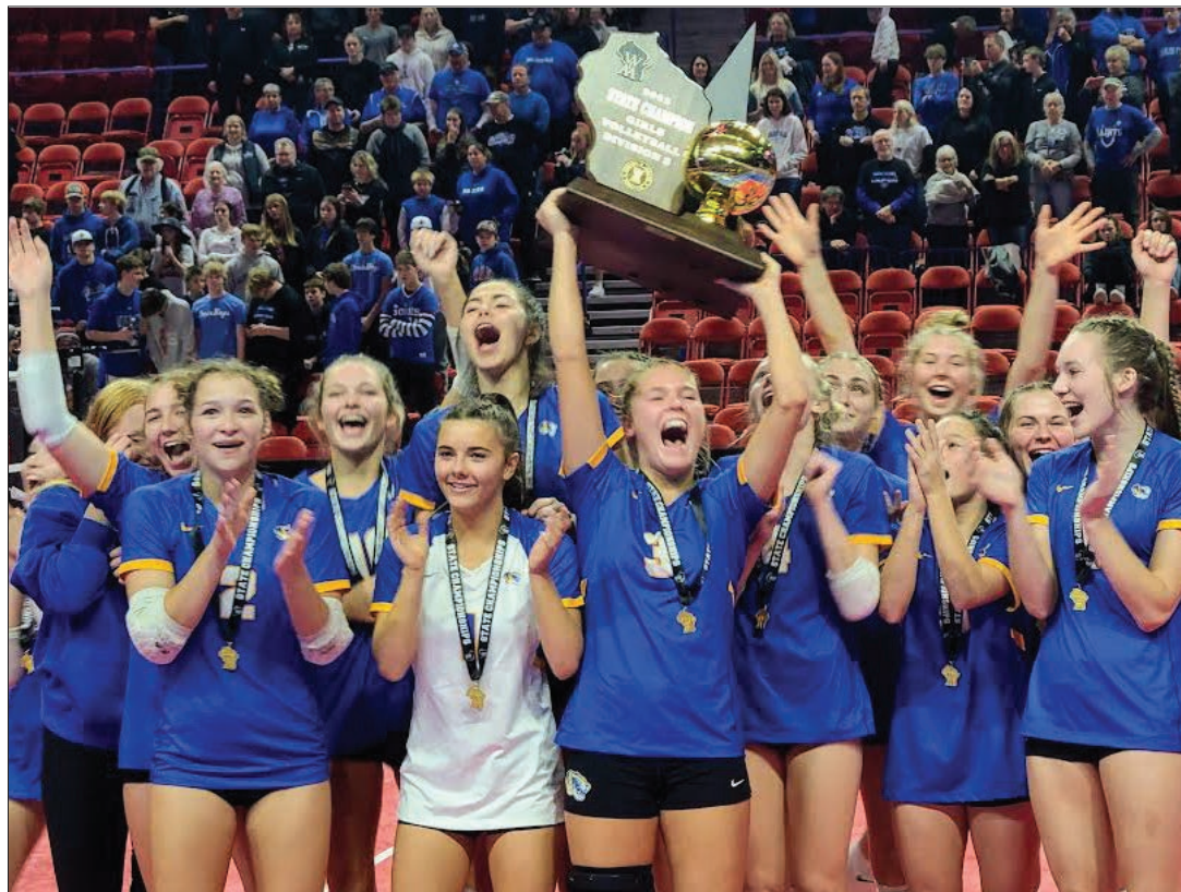
HOWARDS GROVE'S volleyball team celebrates after beating St. Croix Falls for its fourth straight volleyball championship Saturday in Green Bay.

(Previews of winter sports will run in the next issue)