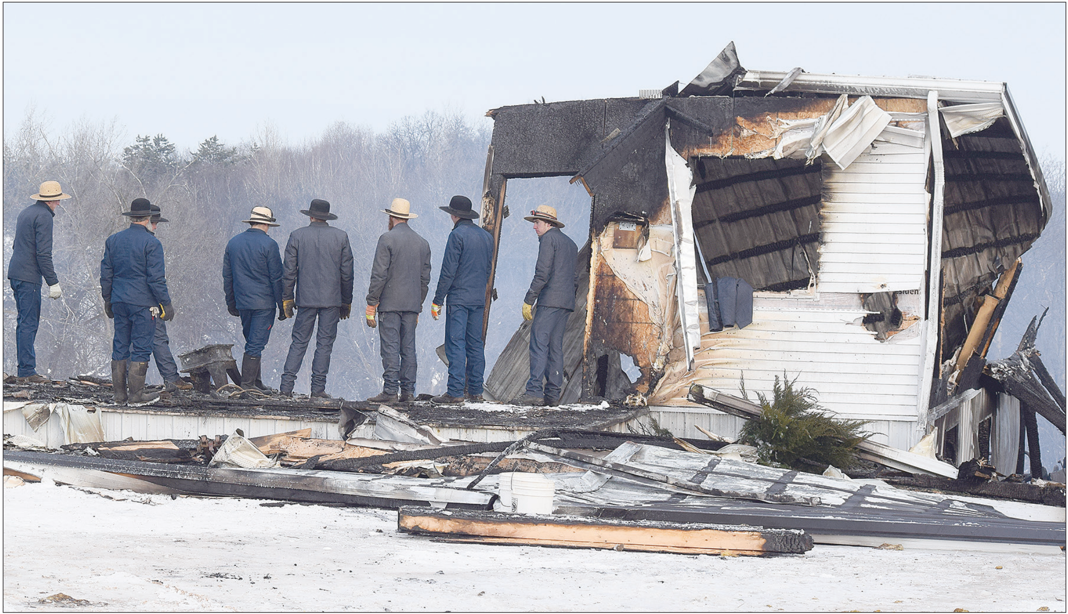
The Amish community gathered Wednesday morning to help clean up the rubble. There were still a few flames Wednesday morning.