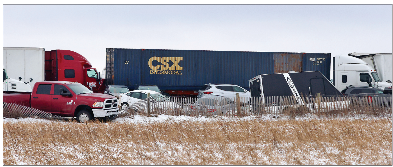
Emergency crews respond to a multivehicle crash in both the north and south lanes of Interstate 90/39 just north of the East Creek Road overpass on Friday afternoon.

with two SUVs loaded on a trailer hitched to his Dodge Ram pickup truck, Lopez suddenly found his pickup racing toward a wall of jackknifed semitrailer trucks on both sides of the highway