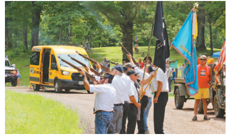
4th of July Celebration pages 8,9,10,16