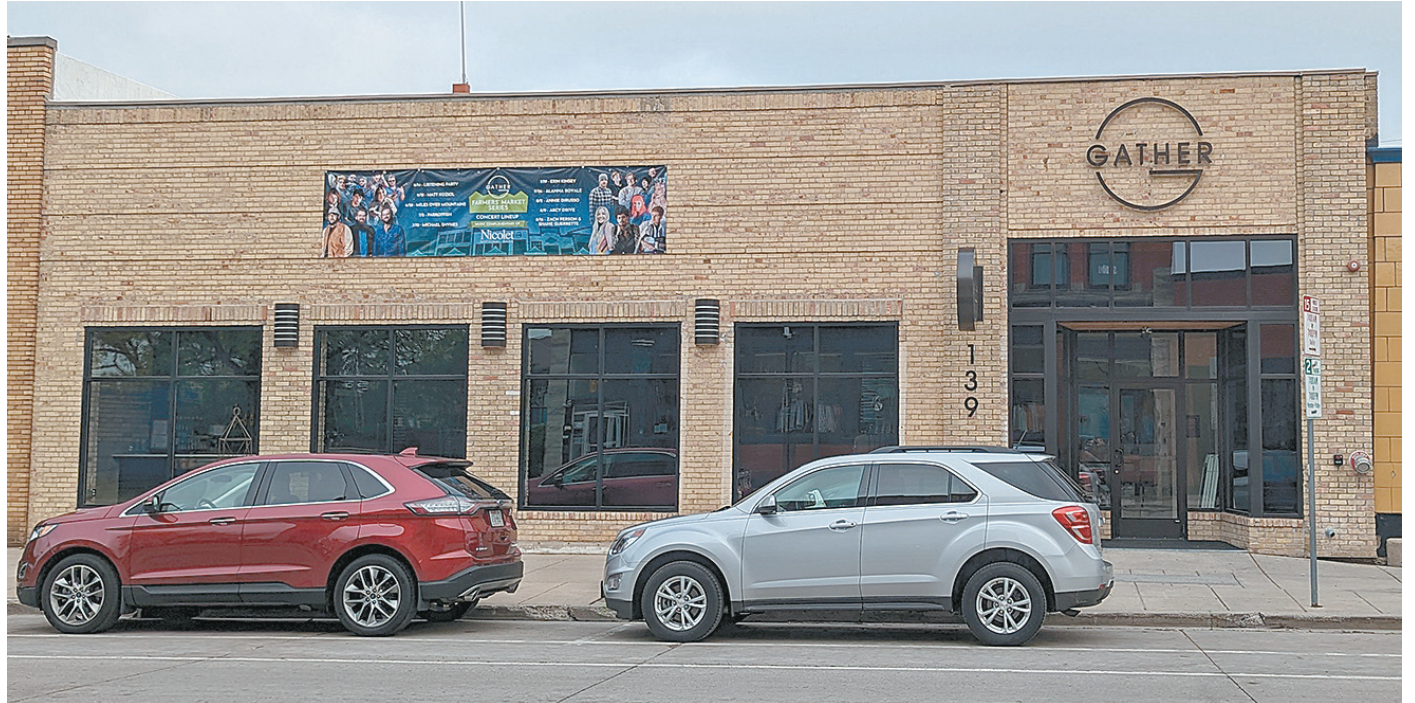
▲ Gather will host concerts featuring a new artist each week during the Farmers' Market on Broadway through August 16.