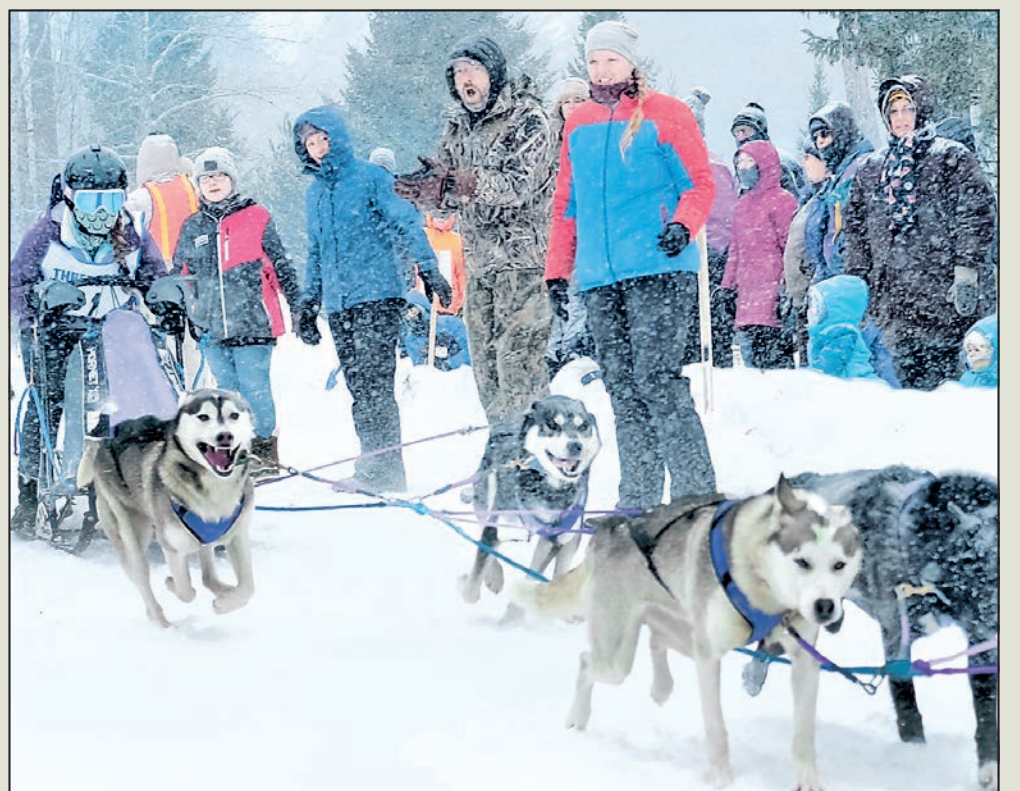
Recent snowfall bodes well for spectators and race fans to attend the 42nd running of the