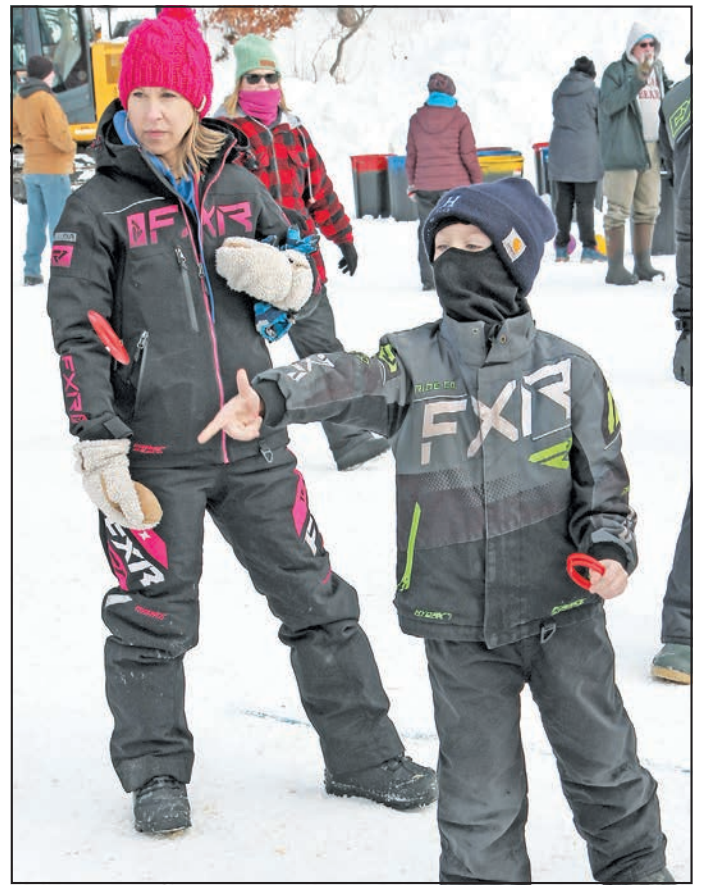
Y'GOTTA REGATTA —Pitlik's Resort hosted its winter regatta last weekend drawing hundreds of participants out despite chilly temperatures. More photos on pg. 1B.