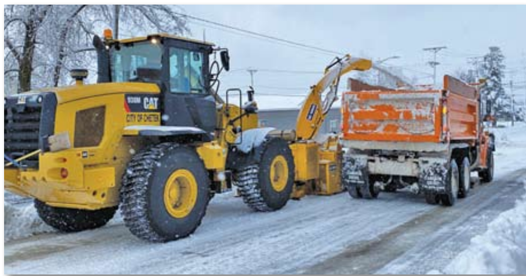
CHETEK ALERT PHOTO

City of Chetek employees have worked around the clock to clean up city streets after the winter storm last week that dumped over one foot of snow on the area from Tuesday, Dec. 13 to Thursday, Dec. 15. Pictured above are two city employees using construction equipment to suck up the snow from Knapp St. and shooting it into a truck that transported the snow to the Chetek Industrial Park.