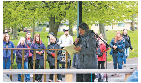
Taylor County Moving for a Cure page 10