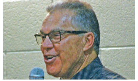
Chamber Recognition Banquet Pages 8-9