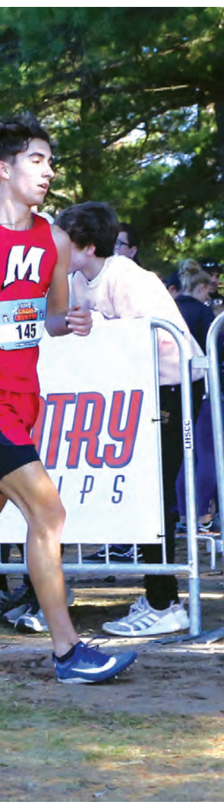
...ce at The Ridges Golf