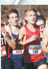
1 MILE 6 th 5:04.6