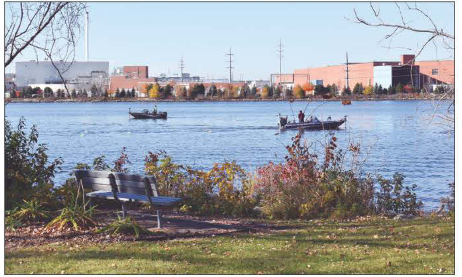
Dozens of walleye fishermen trolled the Fox River between the Georgia Pacific mill and the Hwy. 172 bridge Oct. 28.

Vehicle-deer collisions peak this month as the whitetail mating season is underway. Drivers who hit deer (or others who may be interested) can legally salvage what they can from the carcass once they report it. This phone line — 608-