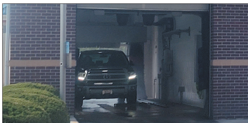
A vehicle goes through the car wash at Kwik Trip off Racine Avenue in Waukesha on Friday. About half of Kwik Trip locations have a car wash.

Waukesha is also getting two new car washes, however, they will be on opposite sides of town. Both are being constructed on the sites of former restaurants that have been demolished. Land near the corner of Sunset