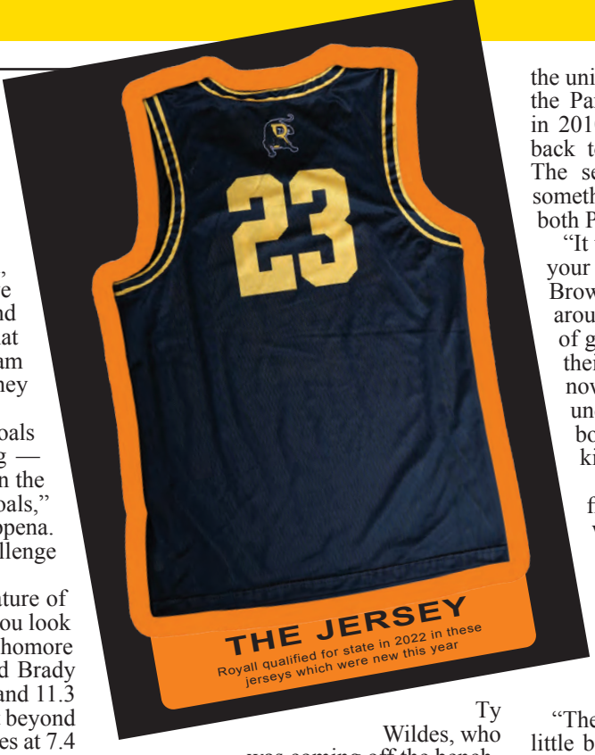
THE JERSEY Royall qualified for state in 2022 in these jerseys which were new this year