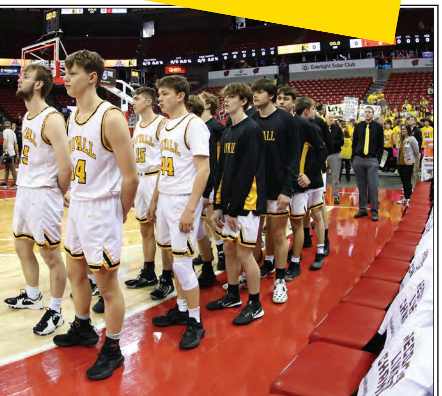
LEFT The Royall basketball team lines up for the National Anthem prior to their Division 5 state semifinal game with Wausau Newman.