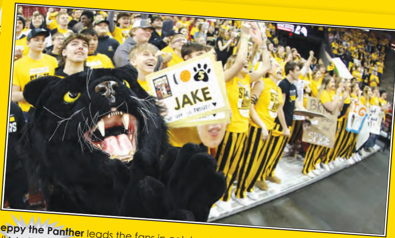
Peppy the Panther leads the fans in celebrating their basketball team at the WIAA state basketball tournament