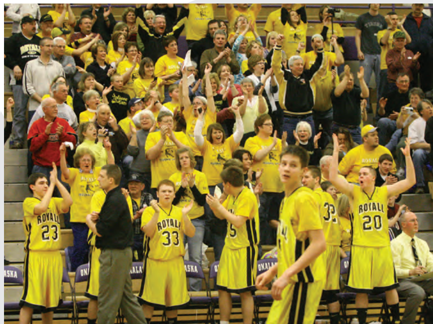
The Royall boys basketball team and its fans celebrate the team's first state berth in 2010. Royall topped Chippewa Falls McDonell at Onalaska to qualify for the Division 4 state tournament.