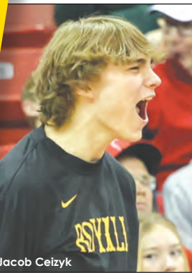
Royall's gold sea of supporters