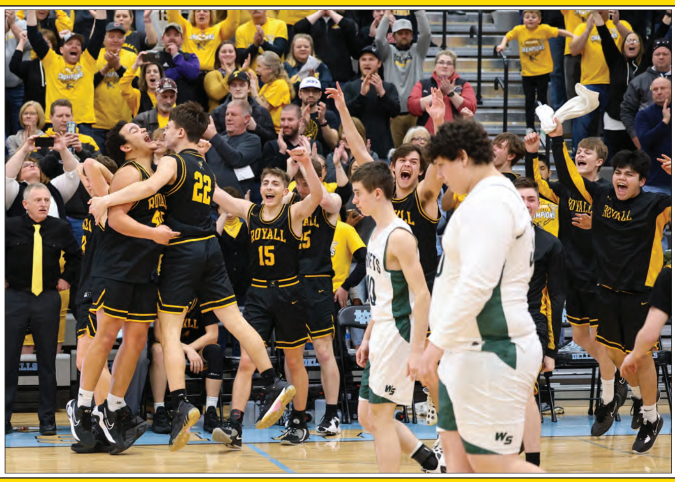
The Royall basketball team spills out onto the court as the final buzzer sounds during the Division 5 sectional final. Royall defeated Wauzeka-Steuben 58-40 to advance to this year's WIAA state tournament. Royall's success in the postseason was a product of team-style play that utilized a deeper rotation than most opponents.