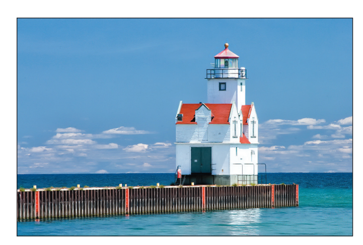
A view of Kewaunee Pierhead Lighthouse in the southern gateway to Door County. The 2022 Fall Door County Lighthouse Festival will run Friday to Sunday.