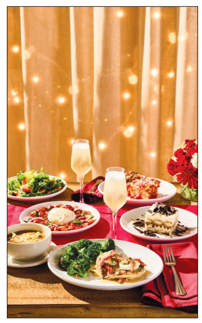
Carrabba's Italian Grill in Brookfield is hosting a specialty four-course dinner for two costing $65 available starting today and running through Sunday, Feb. 19, according to the

- Milwaukee Improv promo of "Laughtentine's Day" with comedian