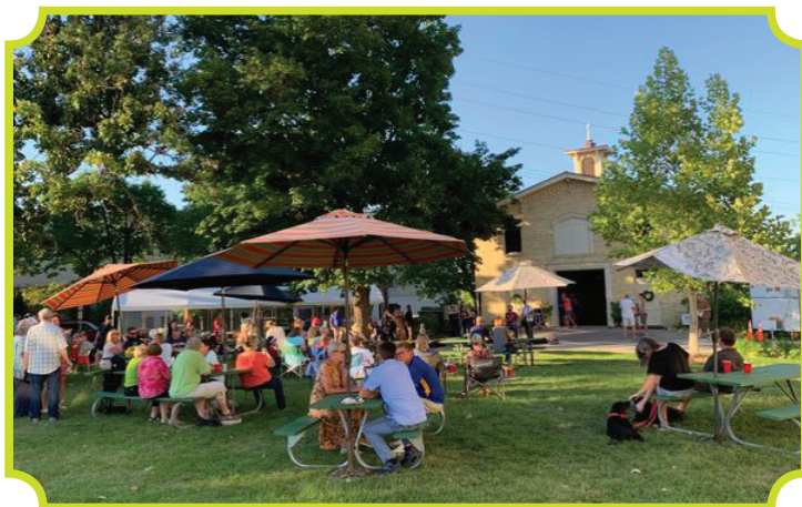
A crowd gathers outside the Tallman Carriage House for food, art, and live music featured at "Artrageous Wednesdays."