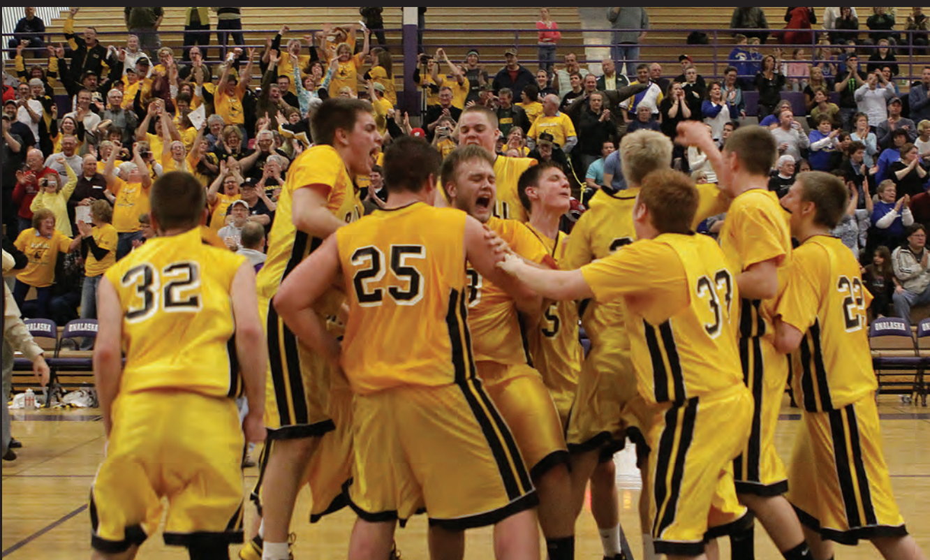
The 2010 version of the Royall boys basketball team rush to meet each other after winning their sectional game against Chippewa Falls McDonell in Onalaska. The Panthers defeated the Macks 47-42 to move on to state in the last year of the old four division system. Royall faced eventual state champion, Randolph, in the state semis, losing 63-35 in their state debut.