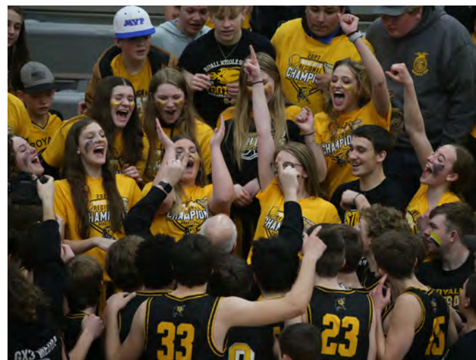
Since school is cancelled on Friday, Royall can expect the spirit of their fellow students to cheer them on in the opening round of the WIAA Division 5 state tournament game.