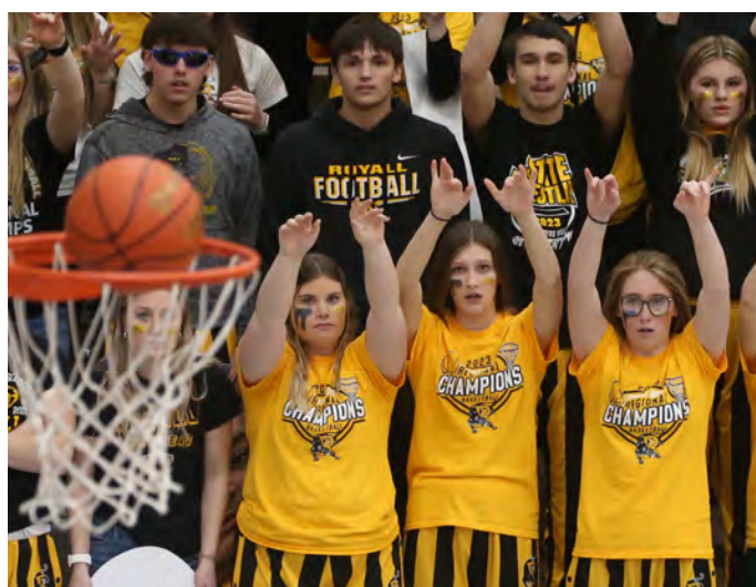
Royall's student section worriedly watches to see if a Panther free throw will sink into the net during the second half of Saturday's sectional championship game against Wauzeka-Steuben.

The Royall boys basketball team swarms around the Division 5 sectional championship plaque after qualifying for state with a 58-40 win over Wauzeka-Steuben Saturday night.