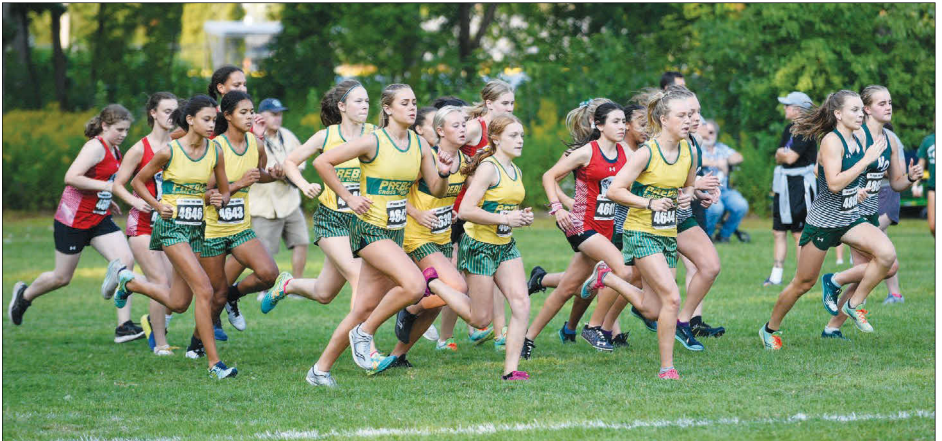
Runners from Preble, East High and Notre Dame Academy jockey for position at the start of the girls' race during the Green Bay City Meet at Colburn Park on Sept. 15.