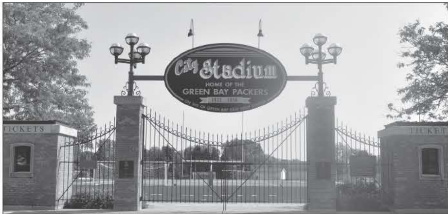
City Stadium will once again host the Green Bay East-Green Bay West rivalry game this season. The 117th meeting between the two schools will be Friday, Sept. 30 at 7 p.m.

Drew Brusoe is a first-year coach for West.