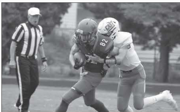
Prior to last season's West victory, East had won six straight games in the series, including in 2019.