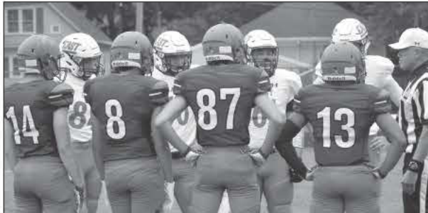
East and West played in 2019 and the Red Devils pulled off a 16-6 victory.

"Eighty-seven Pro Football Hall of Famers played at least one game at City Stadium," football historian