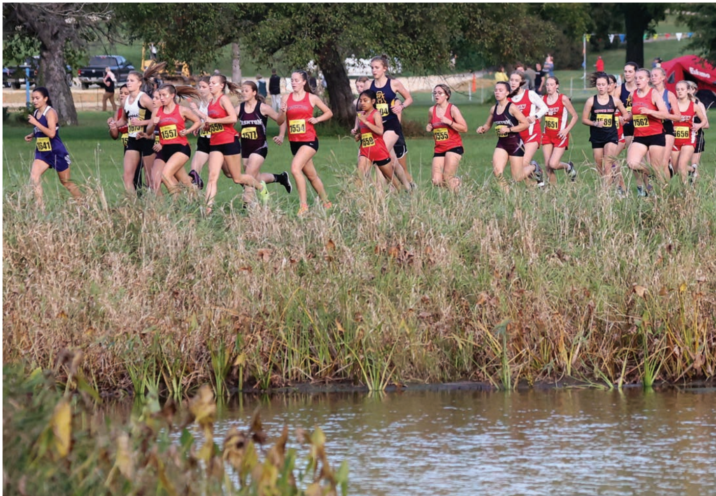
The Brookwood girls cross country team packs together as the herd of runners skirts a water hazard at Maple Grove Venues during Monday's Chileda Classic Brookwood won with a score of 32.

Cashton will run this Saturday in Muscoda at the Riverdale Invite with the first race running at 9:00 a.m.