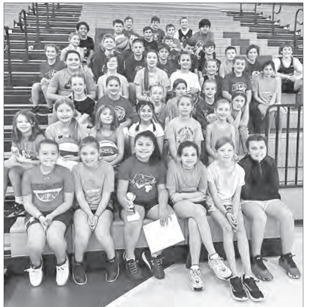
NPBA KICKOFF — The Northland Pines Basketball Association (NPBA) kicked off its basketball season with the Northwoods Skills Challenge held in November at Northland Pines High School. Students in grade four to eight participated and were able to show off their