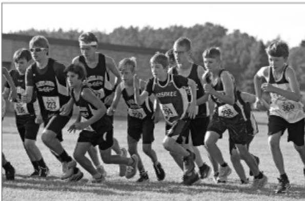
The Lakeland and North Lakeland runners begin the race.