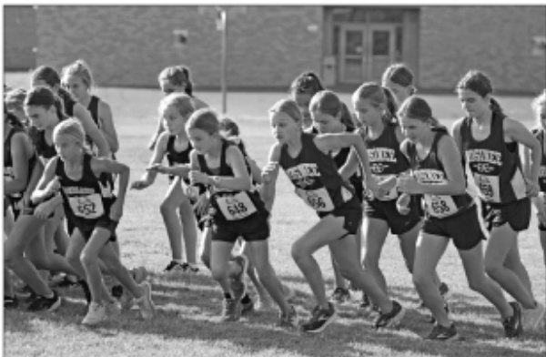
The Lakeland runners take off from the starting line.