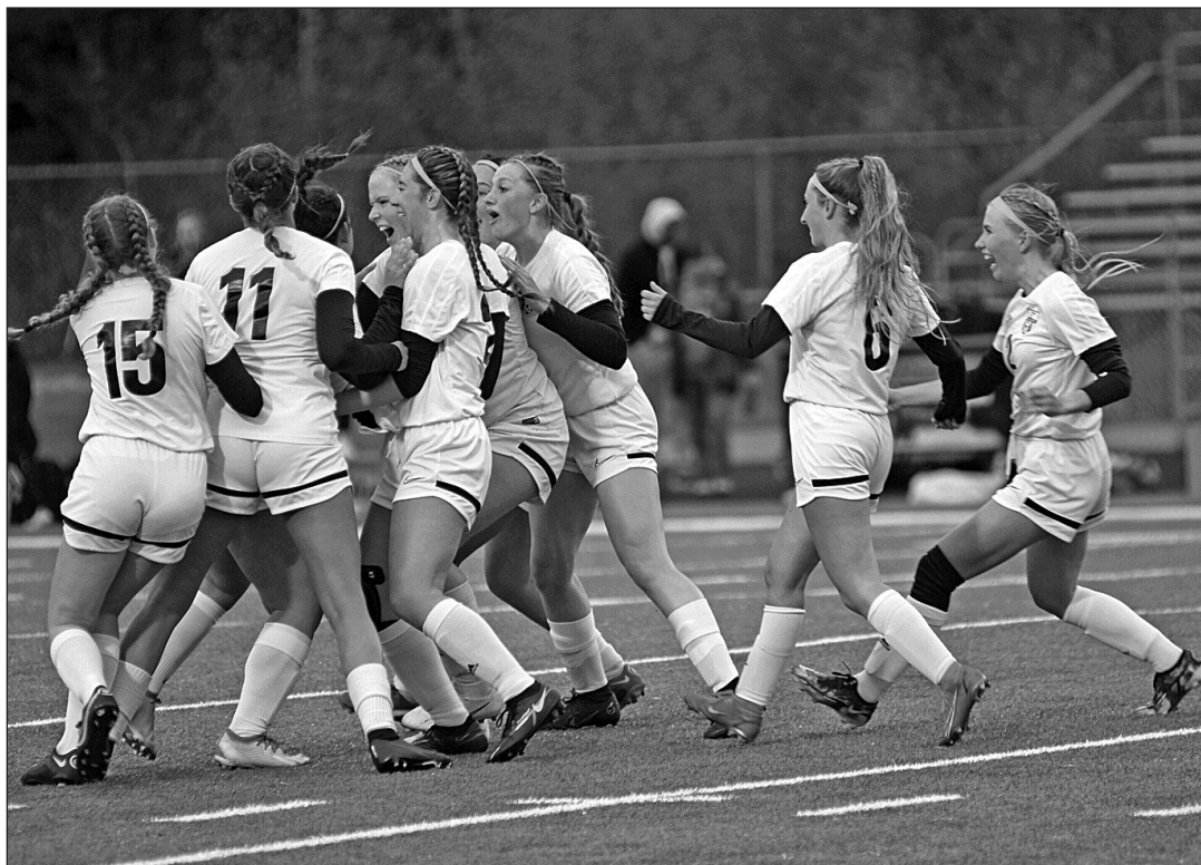
BRETT LABORE/LAKELAND TIMES

"I know we lost a lot of seniors last year, but our pro-