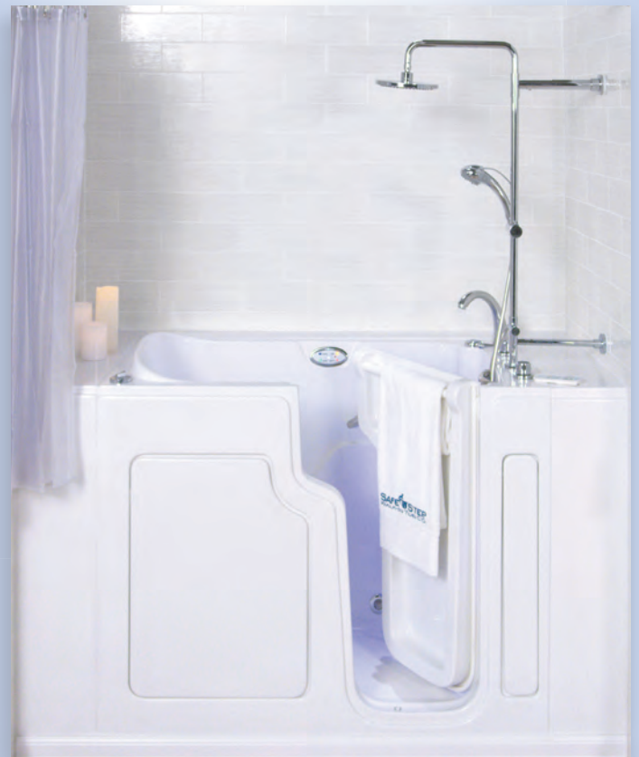
For a limited time only with purchase of a new Safe Step Walk-In Tub. Not applicable with any previous walk-in tub purchase. Offer available while supplies last. No cash value. Must present offer at time of purchase. Financing available with approved credit.