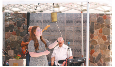
Memorial Day page 16