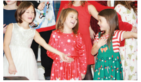
Christmas Greetings Third Section