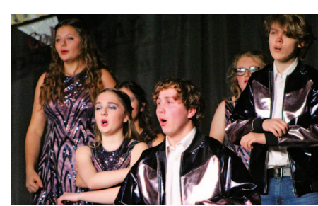
Medford Show Choir competes Page 16