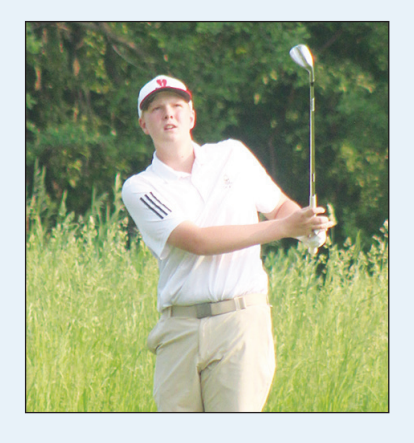
Top 10 finish Lourdes golfer cards success at state