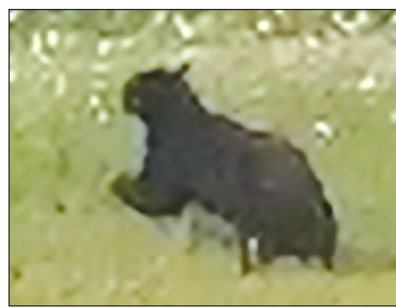
A bear crosses Interstate 94 a few miles west of Highway 67 on Monday evening.