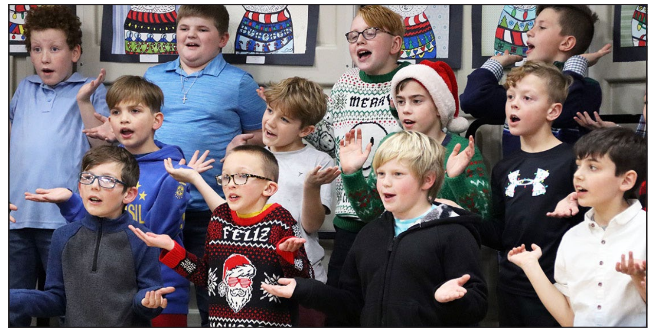
The fourth-grade boys section couldn't see what all the fuss was about with Christmas apparel, but the girls insisted they knew best when singing Ugly Sweater . The young performers also treated the audience to some fancy swing dancing while Swingin' in a Holiday Mood .