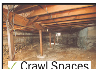
✓ Crawl Spaces